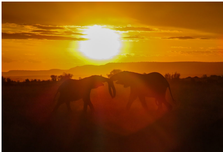
Sunsets and Elephants - Masai Mara

Join the Safari Express Company on its group tours to East Africa. Space is limited so book now to guarantee your window seat to adventure. Pinch yourself...you are going on a safari!!!