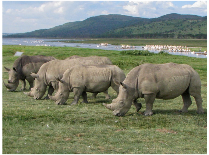
White Rhinos of Lake Nakuru by Tim S. Geiss

Morning and afternoon game drives in wildlife paradise. There is an optional sunrise balloon safari available that includes a champagne breakfast out on the plains of the Masai Mara. True Africa. Overnight at the Mara Simba Lodge. (BLD)