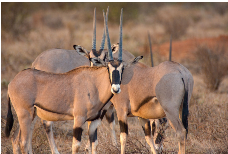
Oryx of Samburu by Tim S. Geiss

Please go to Bush Notes on the Safari Express site for 'Expected Expenses'.