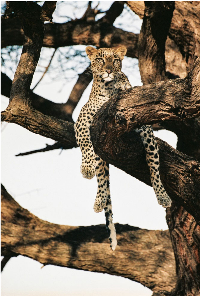
The always cool Leopard by Tim S. Geiss

A National Park are wildlife and botanical sanctuaries that do not allow human habitation or use of the land and is administered by the government. A National Reserve is similar but under certain conditions the land may be used for purposes other than nature conservation. Therefore, some controlled agriculture may be allowed. Administration is done by a body such as a conservancy, local council or trust.