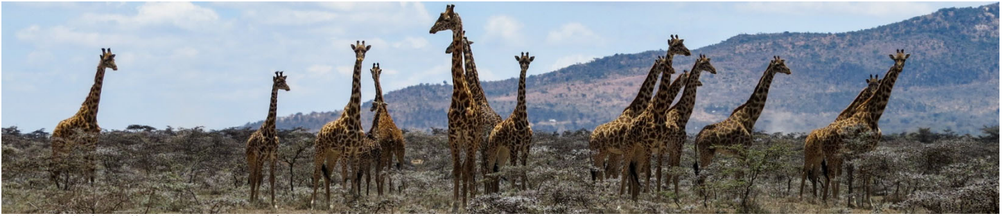
A 'Journey' of Giraffe in the Masai Mara