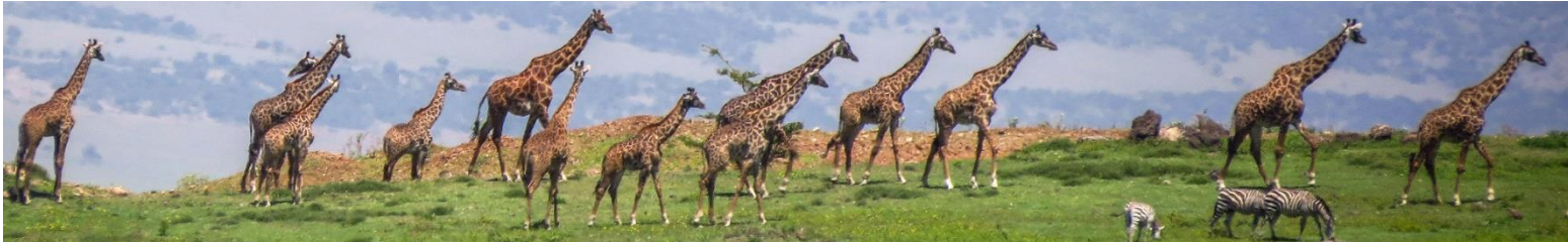
A 'Tower' of Giraffe on the outer slopes of the Ngorongoro Crater