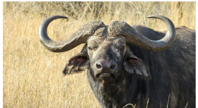
The meanest of the Big Five – Cape Buffalo by Tim S. Geiss

Optional A Sunrise Hot Air Balloon Safari. Enjoy more exploration of this great park possibly visiting one of the many dazzling Kopjes (rocky outcrops) scattered throughout the area. Return in the late afternoon and overnight at your Serengeti lodge. (BLD)