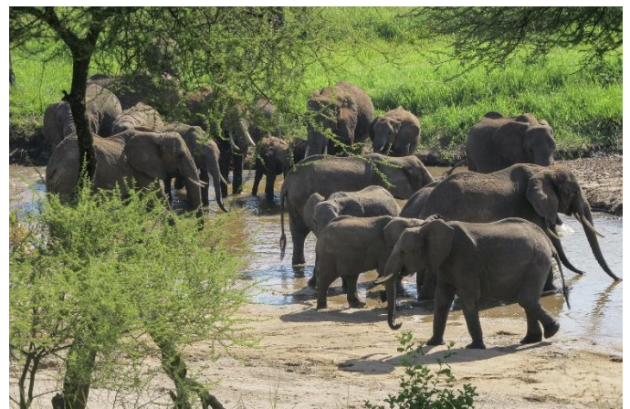
On the Tarangire River

Morning departure for Tarangire National Park. Depending on the season, it's possible to see large herds of elephants throughout the park. Along with many other herbivores they are drawn to the Tarangire River and the Silale Swamp. Overnight at your Tarangire lodge. (BLD)