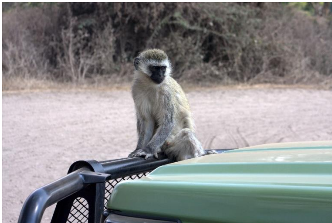
Vervet Monkey looking for hand-outs

Morning and afternoon game drives today. Large Baobab trees are a main feature of the park. While over 500 bird species have been recorded here the big cats may be found as well. Overnight at your Tarangire lodge. (BLD)