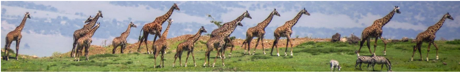
A 'Tower' of Giraffe on the outer slopes of the Ngorongoro Crater