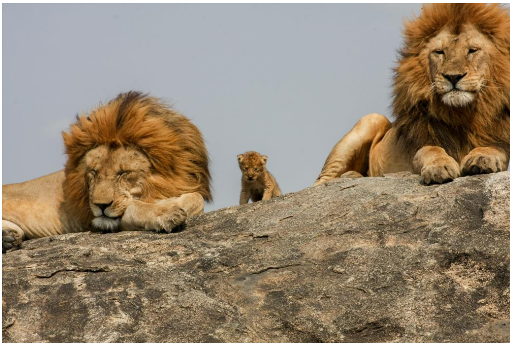
The Would-Be King by Tim S. Geiss