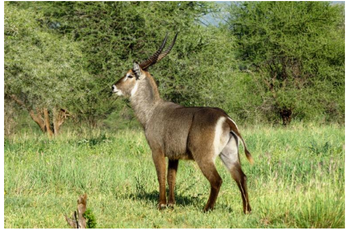
Male Waterbuck posing in Tarangire

Descend back into the Great Rift Valley and over to Tarangire National Park. Large Baobab trees are a main feature of the park. While over 500 bird species have been recorded here the big cats may be found as well. Overnight at your Tarangire lodge. (BLD)