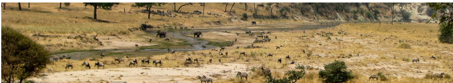
Tarangire River