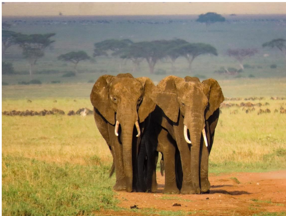
Serengeti Elephant March

Please go to Bush Notes on the Safari Express site for 'Expected Expenses'.