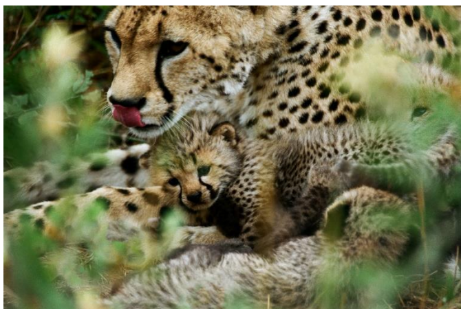
Sweet Cheetah Pose by Tim S. Geiss

Continue on around the rim of the Crater and descend into the Serengeti. Optional visit to the Olduvai Gorge ($30) which sits between the two parks. The drive leading up to the park entrance at Naabi Hill gives you an idea where the park gets its name of Serengeti - Maasai for 'endless plains'. After your picnic lunch you will continue with the game drive en-route to your lodge. Arrive in the late afternoon and overnight at your Serengeti lodge. (BLD)