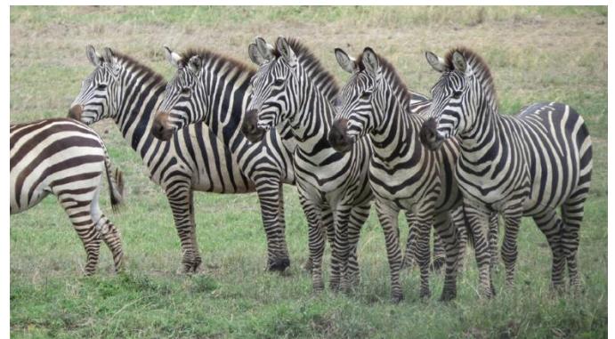
Zebras spot a predator in the Serengeti by Tim S. Geiss

Continue on around the rim of the Crater and descend into the Serengeti. Optional visit to the Olduvai Gorge ($30) which sits between the two parks. The drive