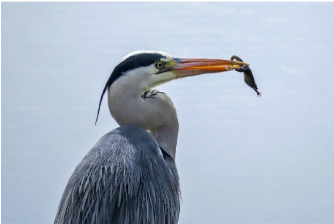
Gray Heron in the Ngorongoro Crater

leading up to the park entrance at Naabi Hill gives you an idea where the park gets its name of Serengeti - Maasai for 'endless plains'. After your picnic lunch you will continue with the game drive en-route to your lodge. Arrive in the late afternoon and overnight at your Serengeti lodge. (BLD)