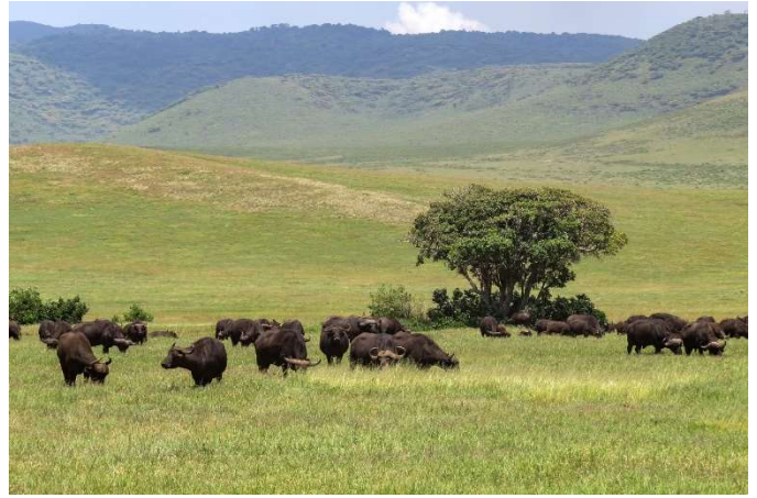
Herd of Cape Buffalo inside 'The Crater' by Tim S. Geiss