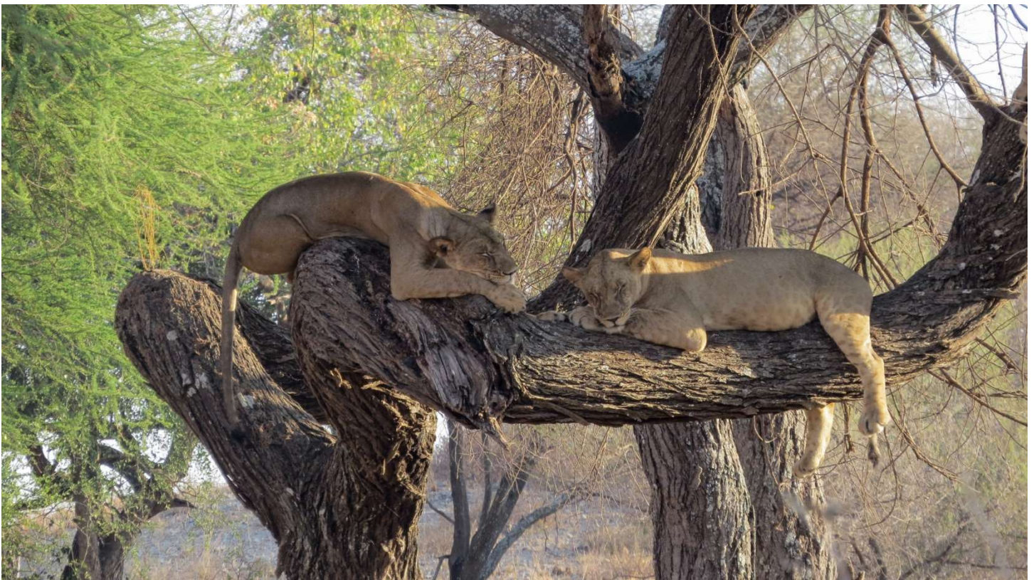
Escaping the heat and the TseTse flies