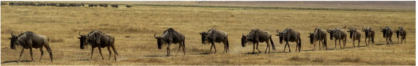
Wildebeest in the Ngorongoro Crater