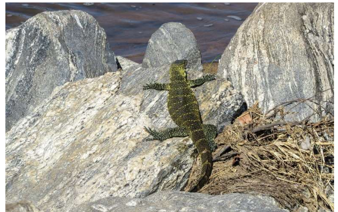
Four foot long Monitor Lizard by Tim S. Geiss

Depart after an early breakfast and drive to Lake Manyara National Park. Game drive in the park through the morning aiming to leave at around noon. Continue to Karatu arriving at your lodge for a late lunch. (BLD)