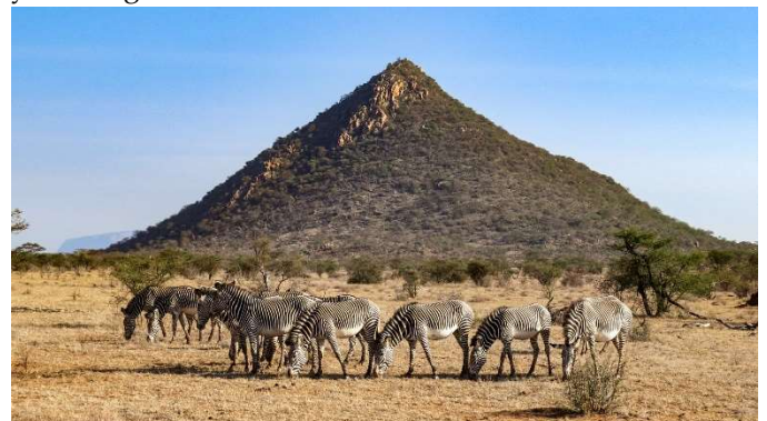
Grevy's Zebra of Samburu by Tim S. Geiss

Your game drives today are looking for the rare, the unusual and the Samburu Five – Reticulated Giraffe, Oryx, Grevy's Zebra, Gerenuk Gazelle and the Blue Somali Ostrich. Wildlife that is only seen in this region. Your first drive takes you out before breakfast. You'll have the midday to relax by the lodge pool or the terrace overlooking the river. In the mid-afternoon there will be another game drive in this wonderful park perhaps giving you an opportunity to see some of the cats. Return to the lodge as the sun is setting. Overnight at your lodge. (BLD)