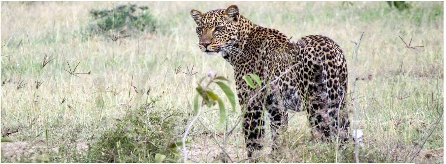
Beautiful leopard