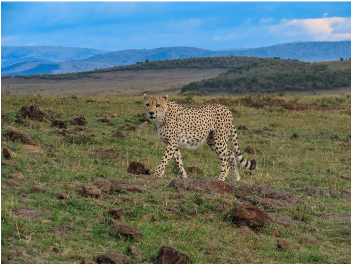
Cheetah in the Masai Mara