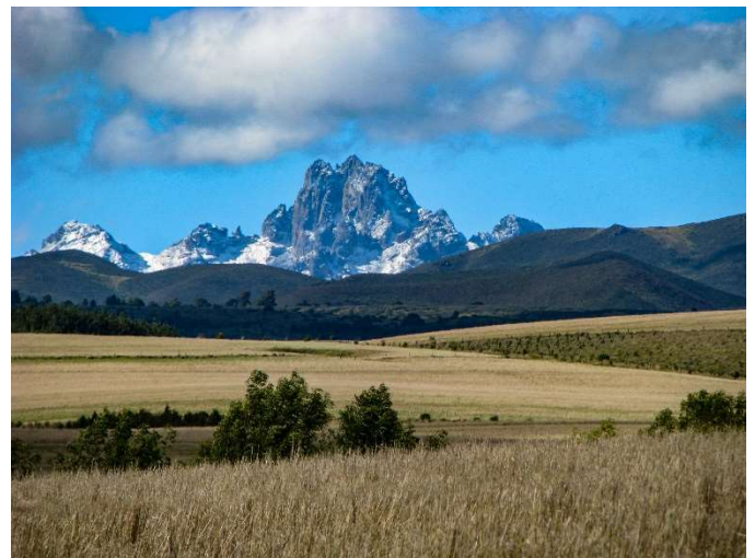
Mt. Kenya - Africa's second highest peak by Tim S. Geiss