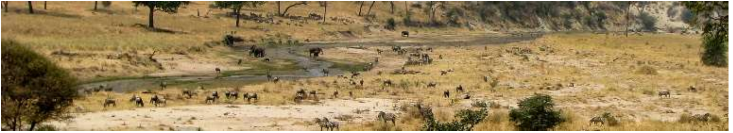
Tarangire River