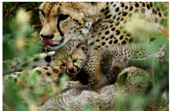
Sweet Cheetah Pose