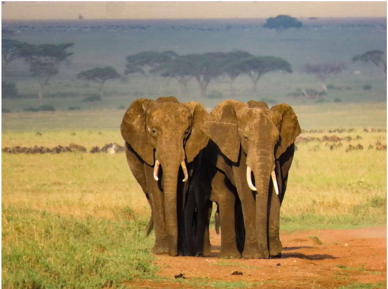
Elephant March in the Serengeti